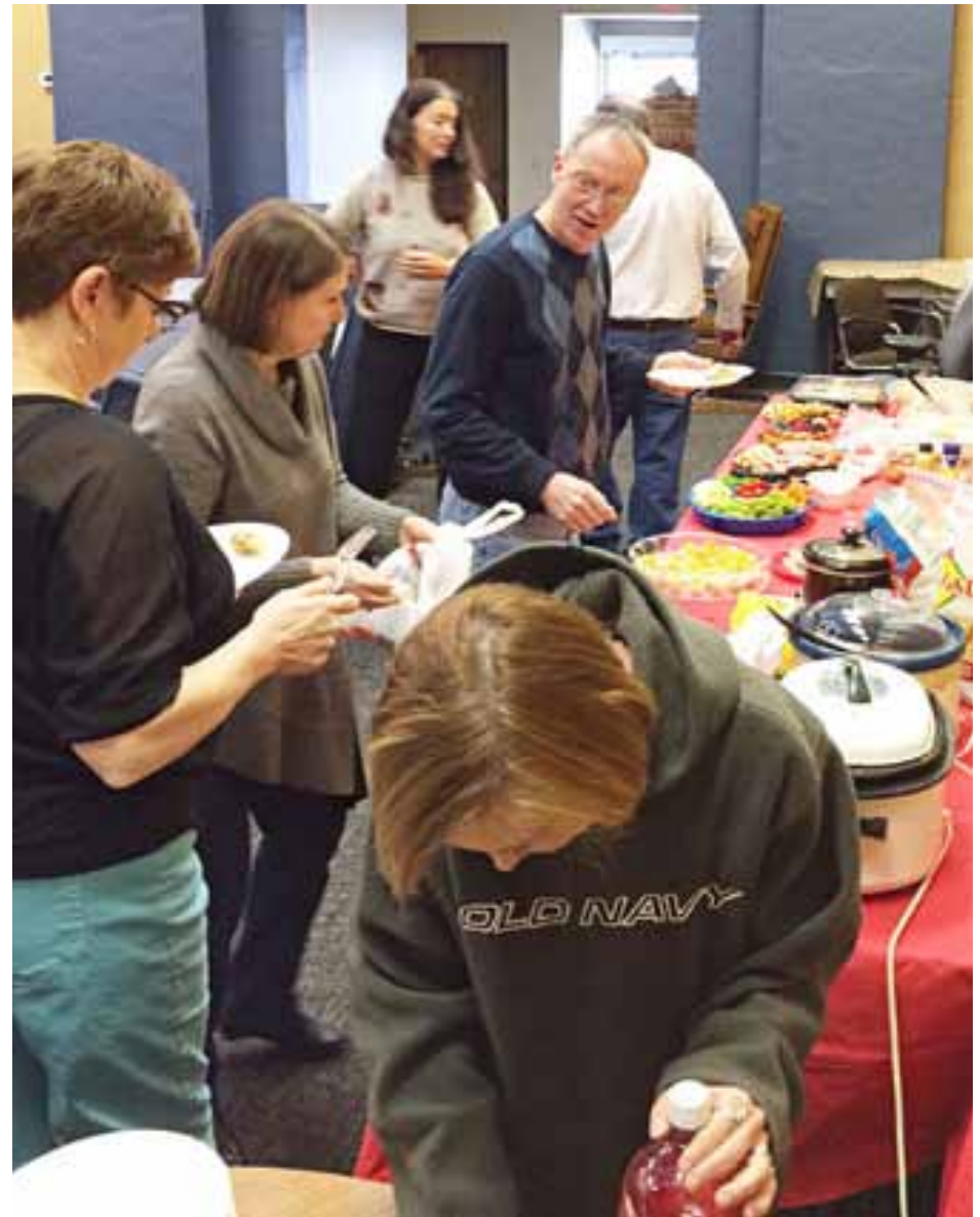
The League's Lincoln staff line up to fill their plates and enjoy a covered dish luncheon Dec. 31, to welcome in the new year.