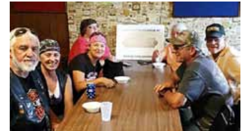
Above left: Bikers stop in Clearwater during the July 16 Benefit Bike Run.