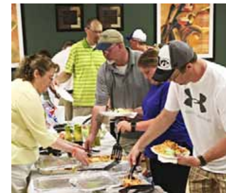
A silent auction, above left, was held throughout the event. A buffet dinner, above right, was provided by Olive Garden.