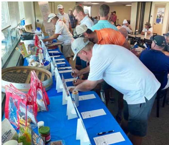
Golfers place their bids on items in the event's silent auction, which ran throughout the day.