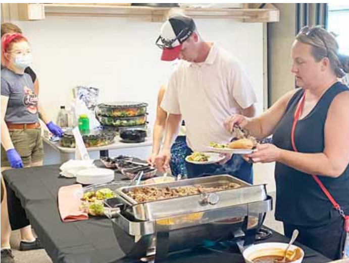
The buffet dinner following the Sept. 16 Golf Event was provided by Telesis Inc./Lazlo's