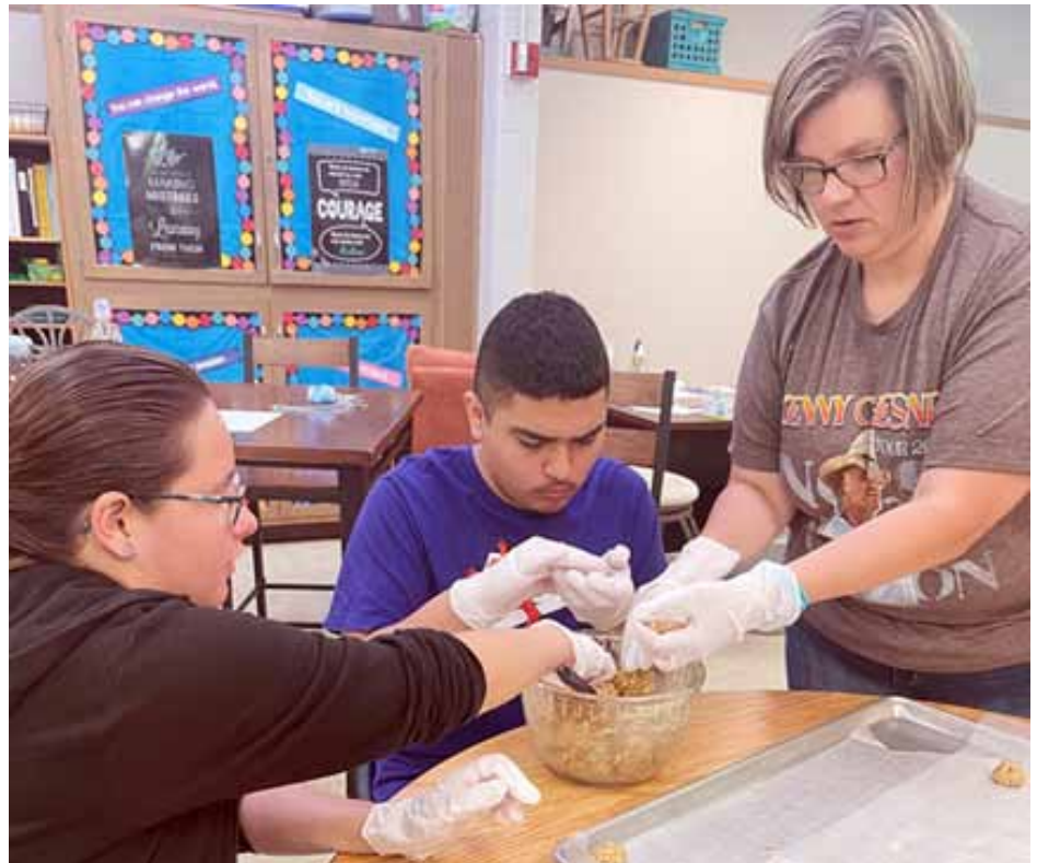
Students and a Norfolk Public Schools paraprofessional take part in “The Independent Chef” cooking class, sponsored by the League and Healthy Blue.

The League looks forward to sponsoring with Healthy Blue again, helping students become independent and confident in their own abilities and desires.