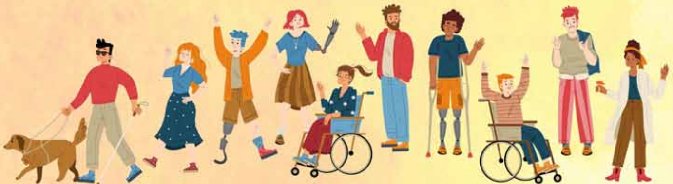
Picture Description: A diverse group of 10 people with and without visible disabilities waving

Look for updates on the celebration on our facebook page at facebook.com/NebraskaDisabilityPride